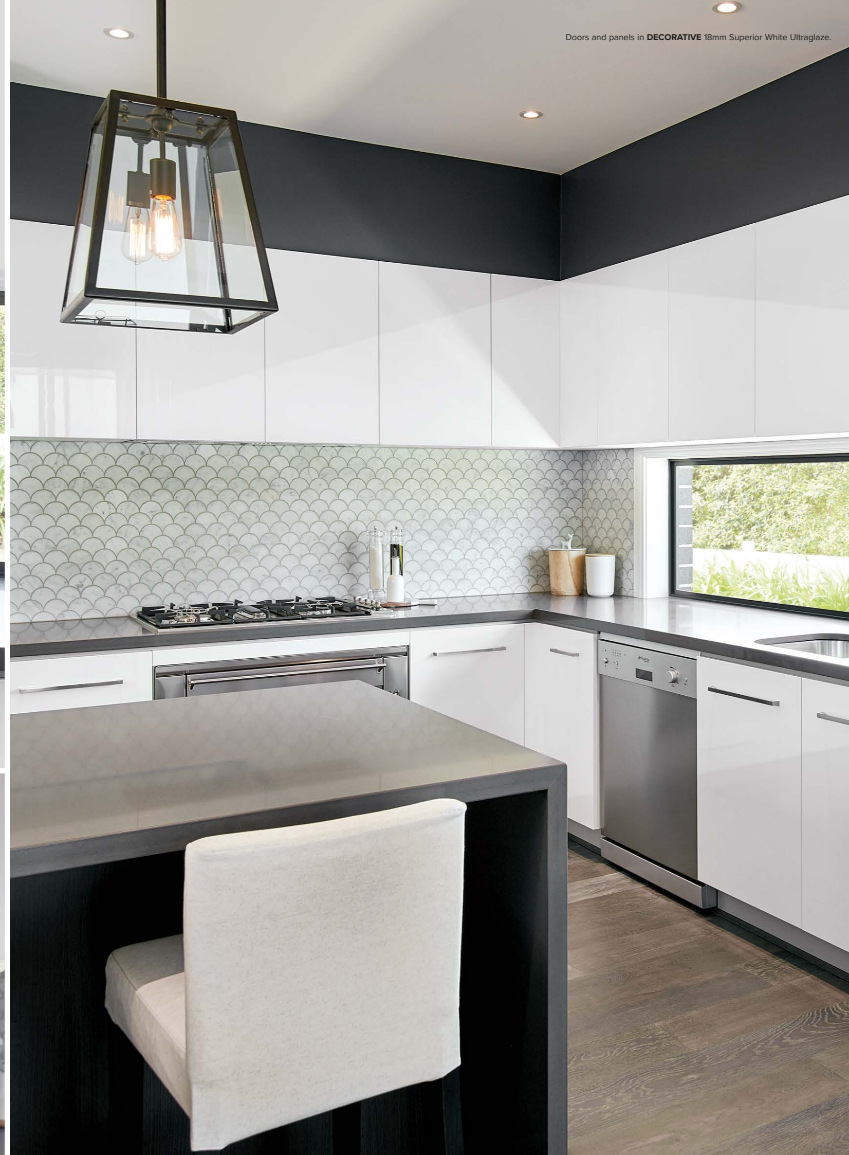
Doors and panels in DECORATIVE 18mm Superior White Ultraglaze.