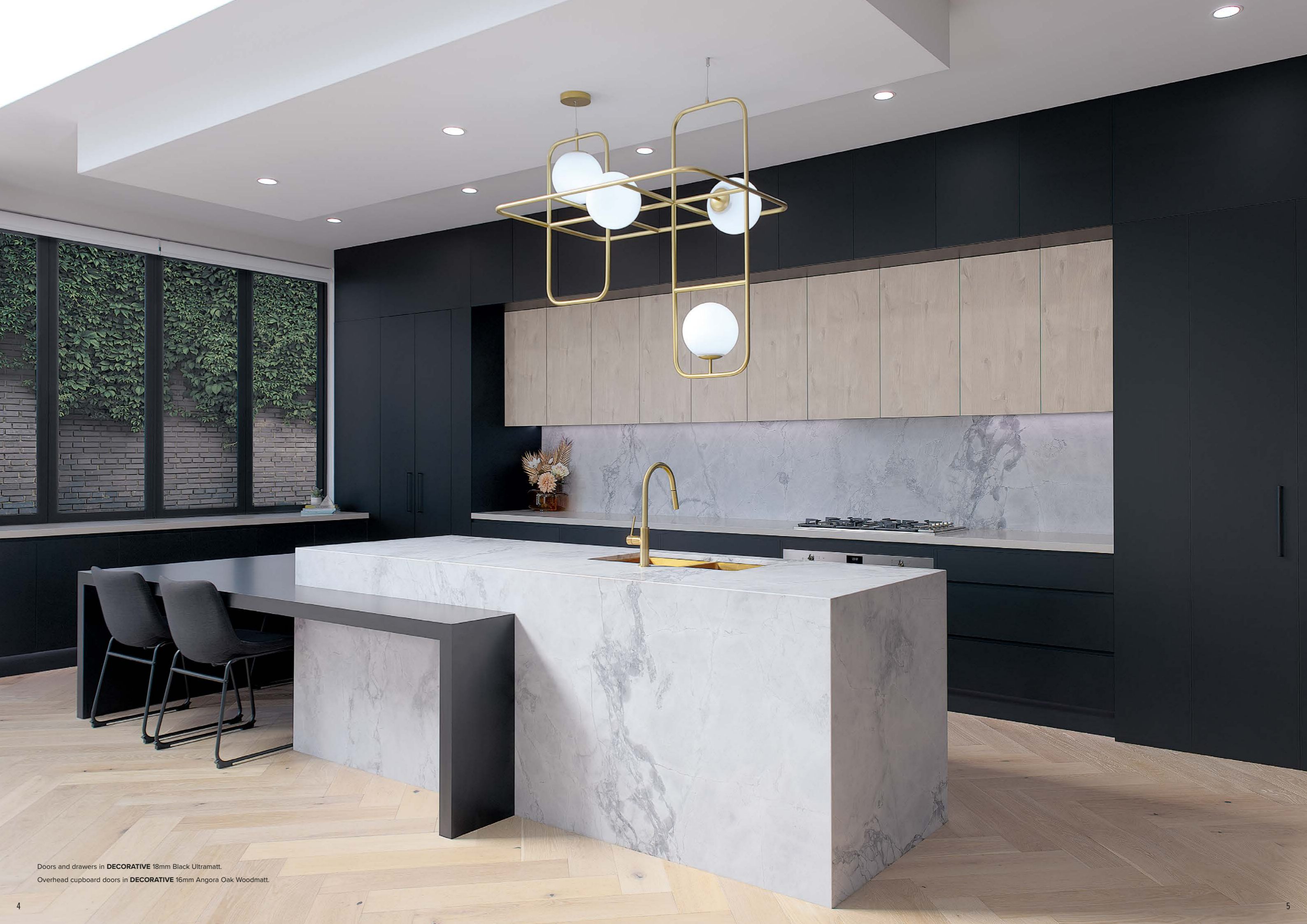
Doors and drawers in DECORATIVE 18mm Black Ultramatt. Overhead cupboard doors in DECORATIVE 16mm Angora Oak Woodmatt.