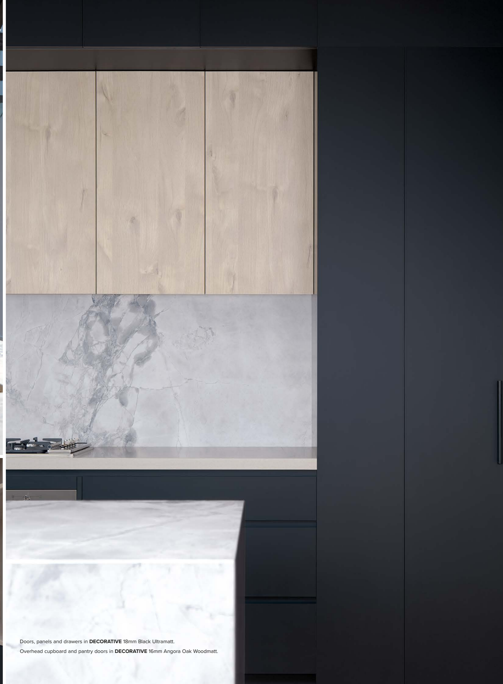
Doors, panels and drawers in DECORATIVE 18mm Black Ultramatt . Overhead cupboard and pantry doors in DECORATIVE 16mm Angora Oak Woodmatt .