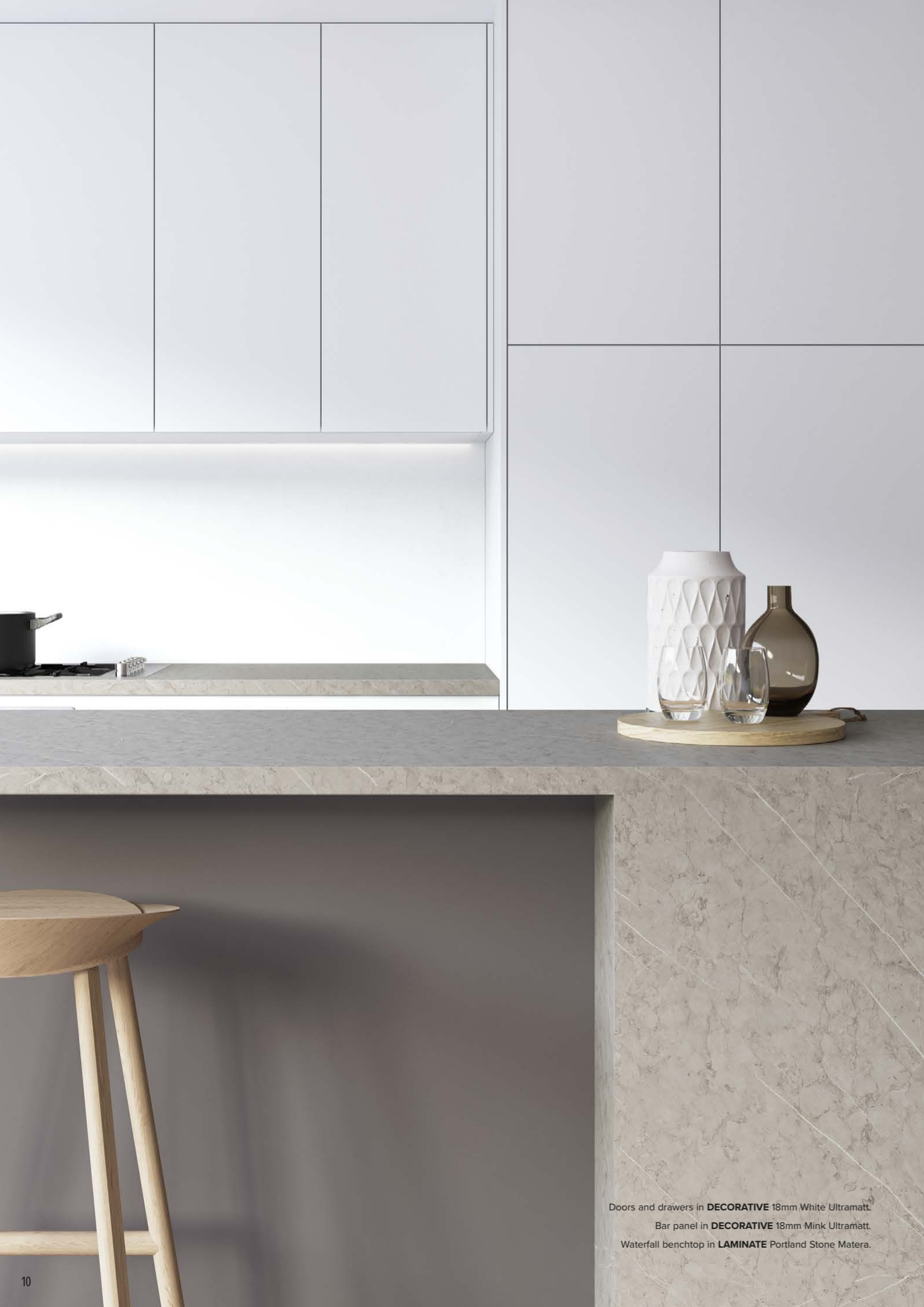
Doors and drawers in DECORATIVE 18mm White Ultramatt. Bar panel in DECORATIVE 18mm Mink Ultramatt. Waterfall benchtop in LAMINATE Portland Stone Matera.